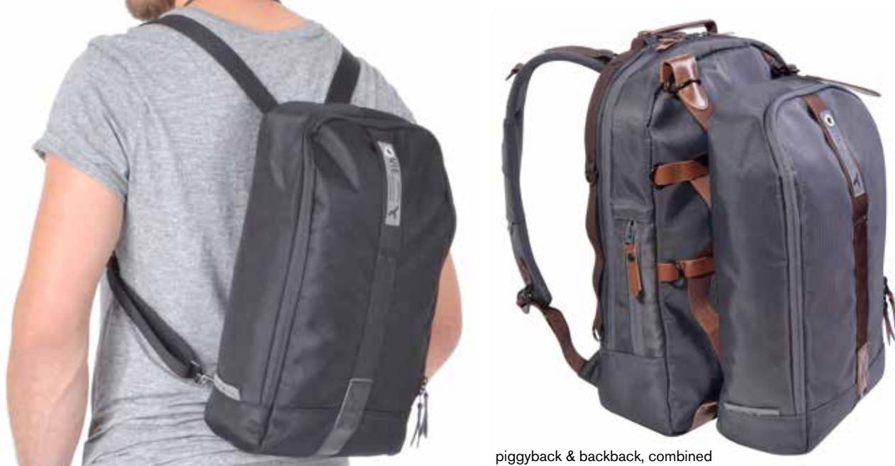
piggyback &amp; backback, combined